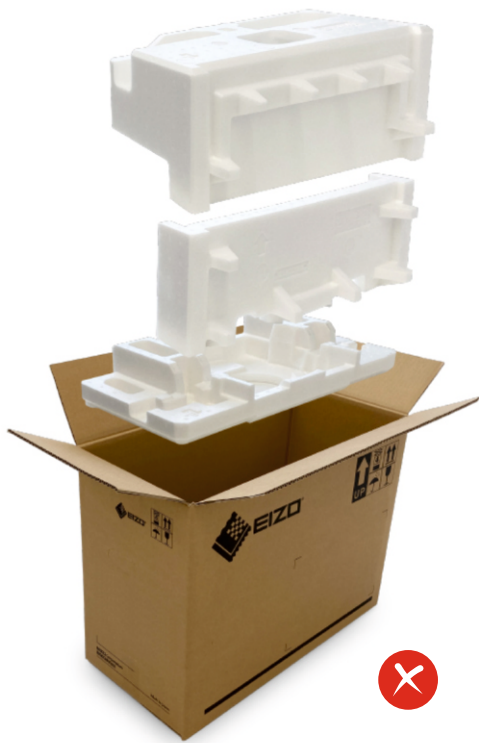
Conventional Packaging Material