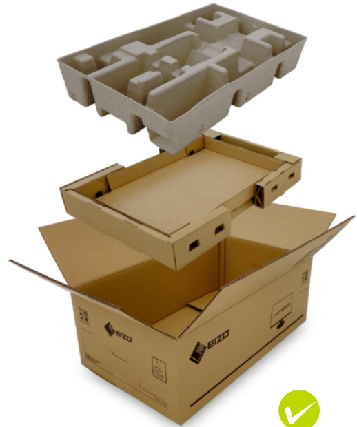
Sustainable Packaging Material